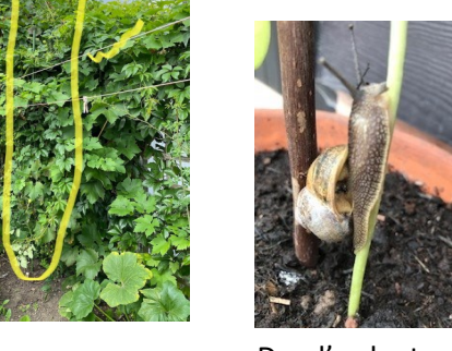
Daryl's plant despite an unwelcome guest managed to grow quite high