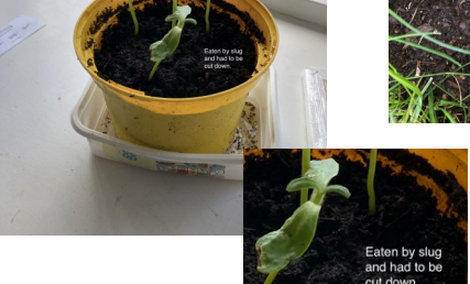
Kwadwo's doing well inspite of being attacked by a slug